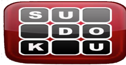
Answer to the Sudoku