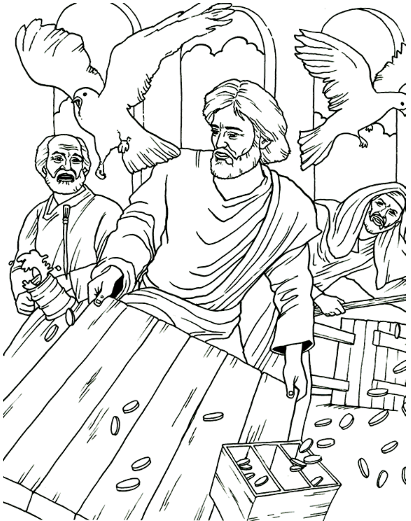
Cleansing the Temple