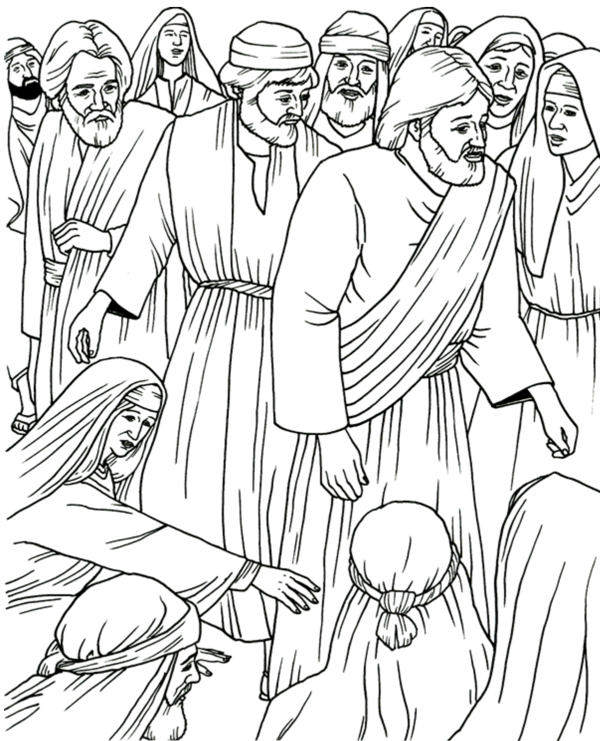
Touching the Garment Mark 5:24-34