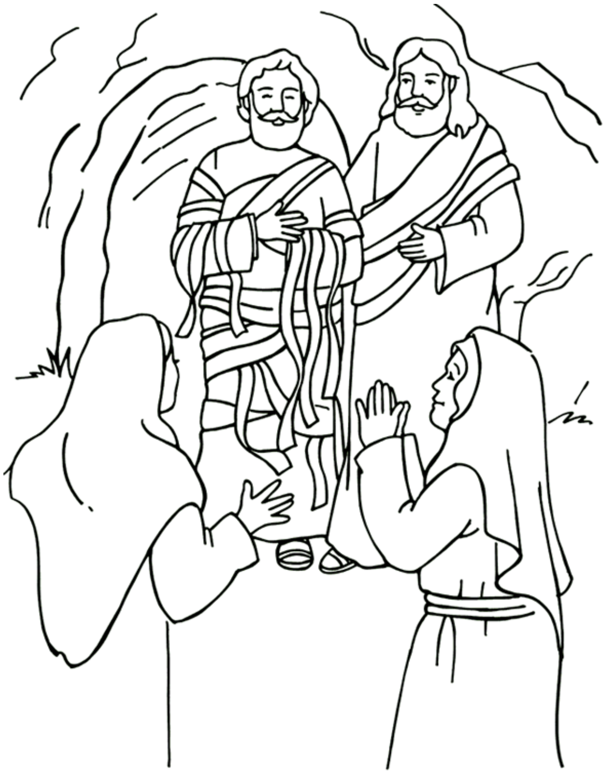
Jesus Raises Lazarus